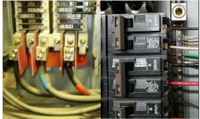
Catch problems early using a thermal imager to improve safety and reduce risk of electrical fire.

Equipment described herein is subject to US export regulations and may require a license prior to export. Diversion contrary to US law is prohibited. ©2019 FLIR Systems, Inc. All rights reserved. 06/19 – 18-2915-INS